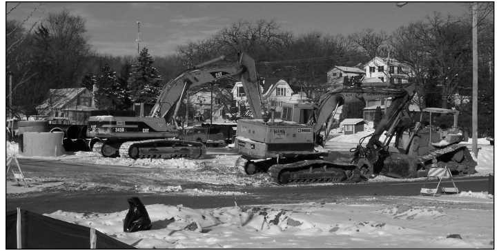
THE FONTANA BOULEVARD utility construction project is under way.

The proposed residential development for the abandoned quarry, "The Cliff's of Fontana," is still in the planning stages. The 66-unit residential condominium project, presented by PAR Development, received approval of a general development plan this fall and the developer anticipates submitting the precise