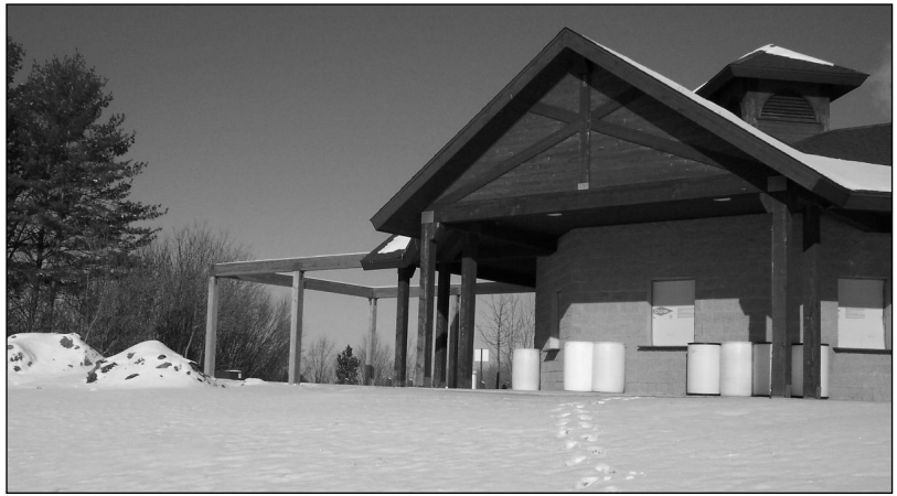
THE NEW WING on the park shelter at the Duck Pond Recreation Area will be completed by summer.

Residents should make arrangements to have their trash and recyclable receptacles moved back from the curb and returned to their storage areas after collection.